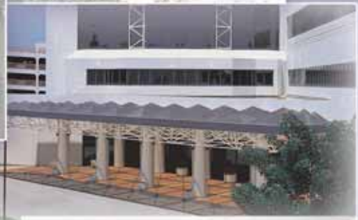
Children's Hospital of Orange Orange, California