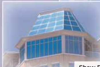
Shaw Park Plaza St. Louis, Missouri