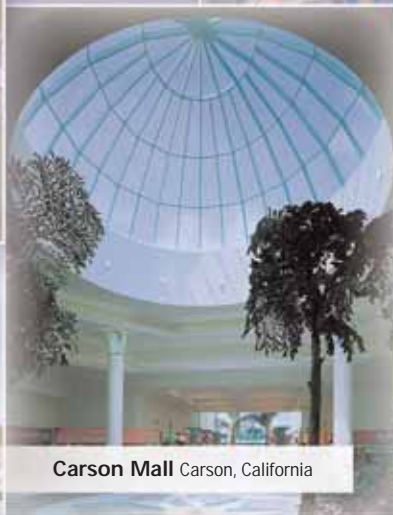
Carson Mall Carson, California