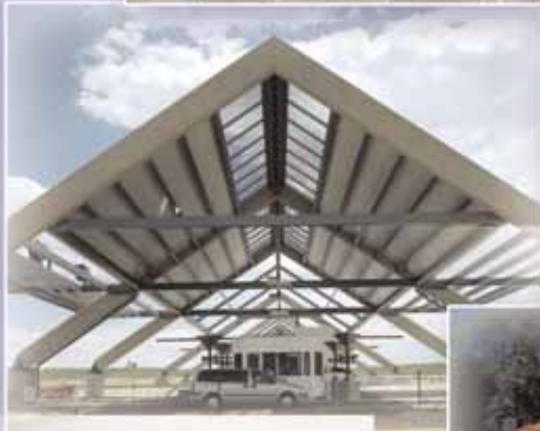
Toll Plaza E Denver, Colorado