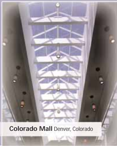
Colorado Mall Denver, Colorado

These photos are a fine example of Bristolite's diverse capabilities and product line. From two-by-two's to monumental lighting systems, our quality is a time proven fact in the skylighting industry.