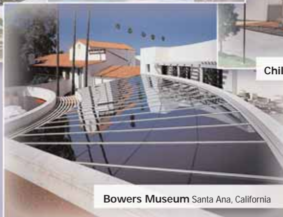
Bowers Museum Santa Ana, California