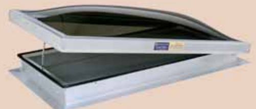
Model AL-SD & AL-ESD