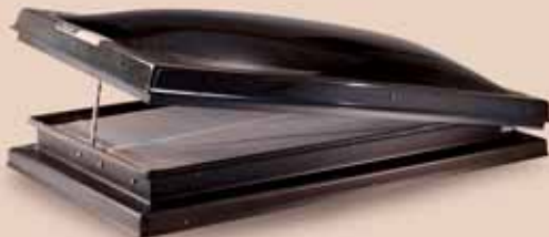
Model AS-SD & AS-ESD