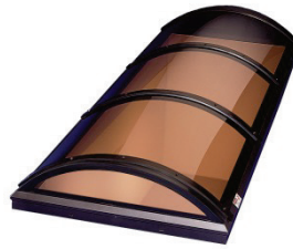
Continuous Vaulted Skylight