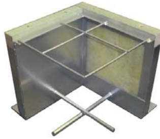
Structural Roof Curb