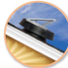
medium position for standard pitched roofs