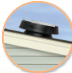
lowest position for flat or low sloping roofs

The Solar Breeze Attic Fan features an exclusively designed adjustable bracket allowing the solar panel to be positioned at various angles for optimal solar exposure.