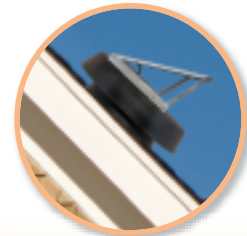
maximum position for steep roofs