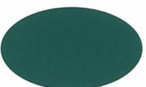
SEA MIST GREEN UC106721XL/3ZMG87000P