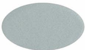
WHITE ICE METALLIC UC106706XL/3ZMA86983P