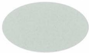
METALLIC MIST UC106703XL/3ZMA86980P