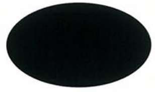
BLACK Classic UC40577/5MB86928 PD900001

UC Code = extrusion (liquid) code number 5M/3XM Code = coil (liquid) code number PD Code = extrusion (powder) code number