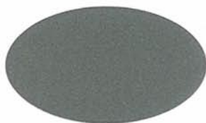
PEWTER Classic UC51713XL/3ZMA86280P