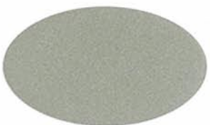
FAWN METALLIC UC106710XL/3ZMN86988P