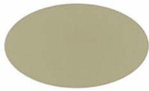
PORTABELLO UC105733/5MN86918 PD200008