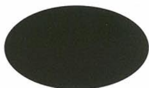
CHOCOLATE BRONZE UC106709XL/3ZMN86986P