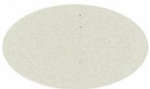
VANILLA SAND UC105757VL**/3ZMI86987P