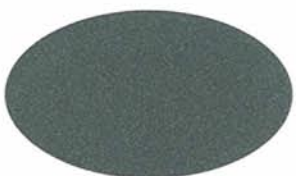
SILVER SHADOW UC106707XL/3ZMA86984P