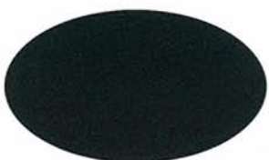
GRAPHITE GRAY UC106708LB*/3ZMB86985P