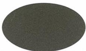
SUMMER SUEDE METALLIC UC106712XL/3ZMN86990P