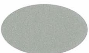
ICED CAPPUCCINO UC106713XL/3ZMN86991P