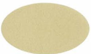
EARTHEN GOLD UC106716LB*/4ZMY86995B*