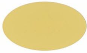
SESAME SEED UC105742/5MY86898 PD300001