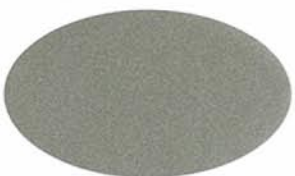
AUTUMNWOOD METALLIC UC106711LB*/3ZMN86989P