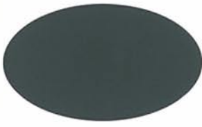
ECLIPSE GRAY UC106669/5MA86799 PD900000