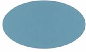
BAYVIEW BLUE UC106660/5ML86929 PD500002