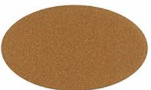
CINNAGOLD DUST UC106717XL/3ZMR86996P