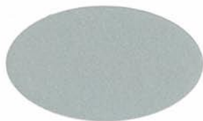
SILVER Classic UC51131XL/3ZMA86386P