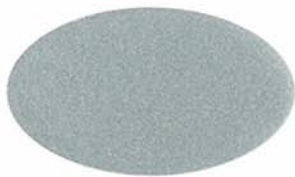
STEEL-CITY SILVER UC106705XL/3ZMA86982P