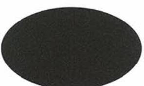
VINTAGE BRONZE UC106714XL/3ZMN86993P