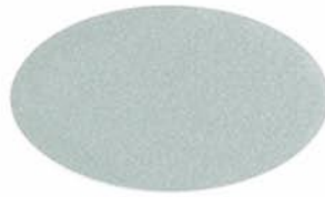
PLATINUM MICA UC106682F/5VMA86955P