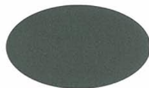
MEDIUM GRAY Classic UC51595XL/3ZMA86440P