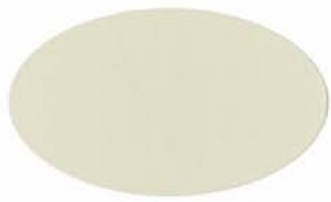
MALT UC105738/5MI86783 PD200007