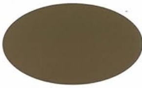
BUCKHEAD BROWN UC105734/5MN86923 PD200009