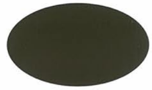
COCOA BEAN UC105735/5MN86924 PD200010