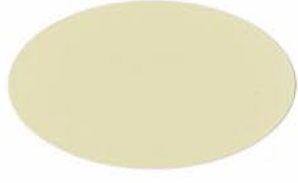
MYSTIC BEIGE UC105739/5MI86822 PD200004