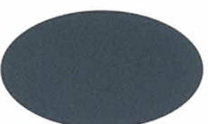
OXFORD BLUE METALLIC UC106722LB*/3ZML87001P