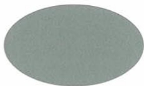
SILVER GRAY Classic UC50958XL/3ZMA86715P