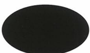
MINERAL BROWN METALLIC UC106715XL/3ZMN86994P