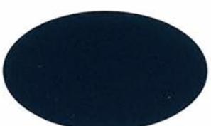
MIDNIGHT BLUE ICE UC106723LB*/3ZML87002P

UC Code = Extrusion Code Number 3ZM/4ZM Code = Coil Code Number