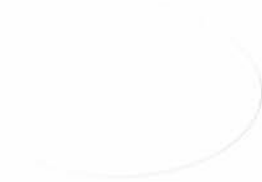
BRIGHT WHITE UC55026/5MW86849 PD800001