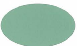
SILVER SAGE METALLIC UC106720XL/3ZMG86999P