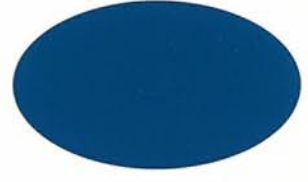
BERMUDA BLUE UC106661/5ML86922P PD500000