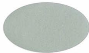
CHAMPAGNE GOLD Classic UC51568XL/3ZMA82897P