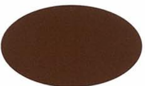
COPPER CANYON UC106718XL/3ZMN86997P