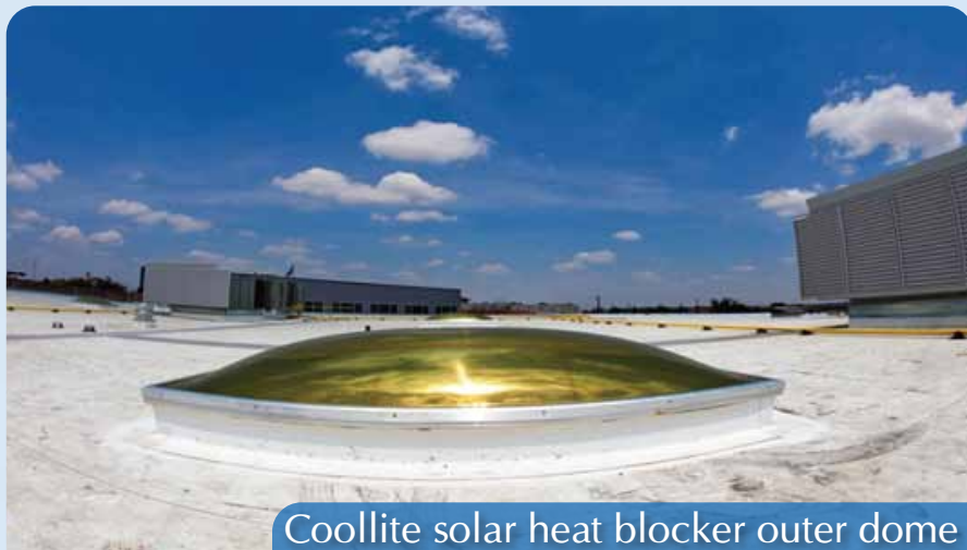
Coollite solar heat blocker outer dome

Energy Efficient Solar Control Low-E Acrylic and Polycarbonate Glazed Skylights