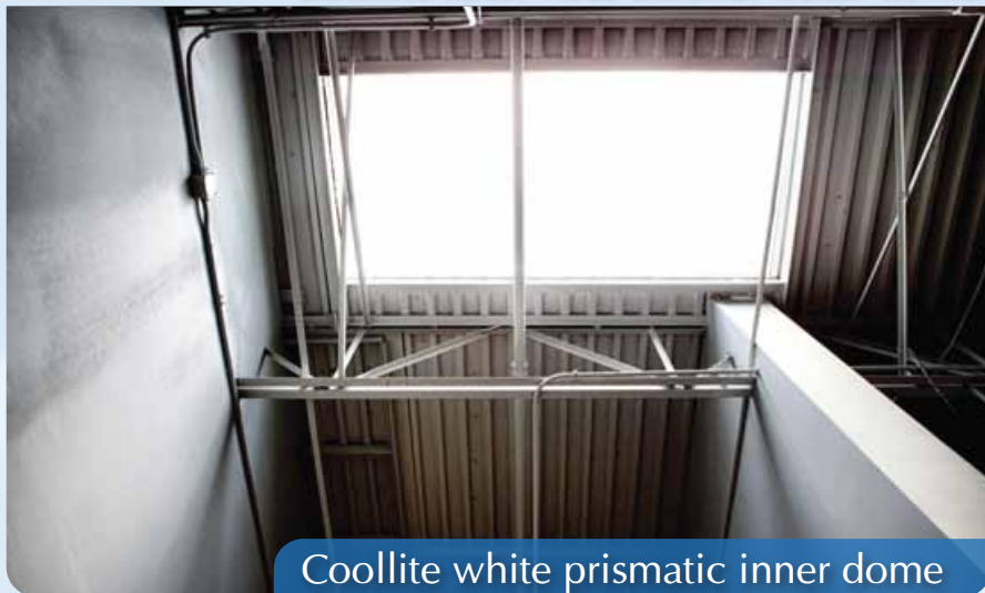
Coollite white prismatic inner dome