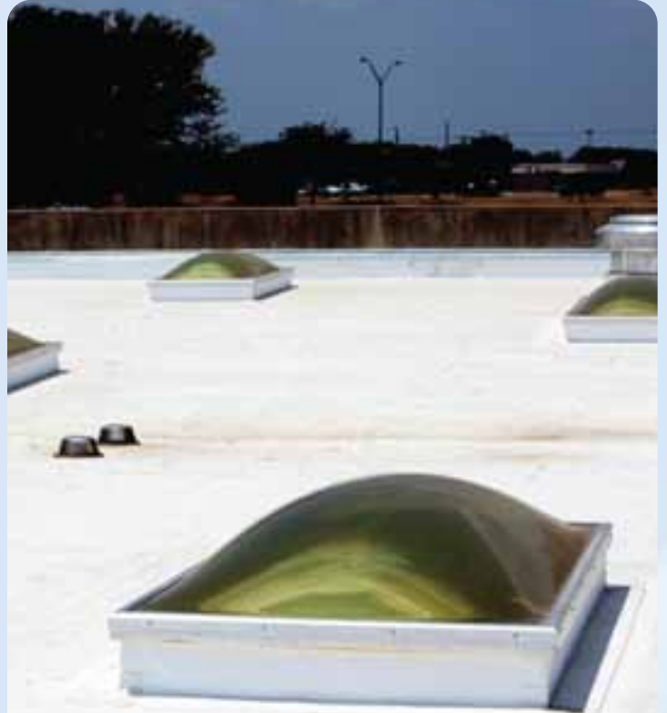
Coollites on the roof

Beyond its energy cost savings, Coollite dramatically reduce the level of CO2 emissions associated with the heating and cooling of commercial and residential structures.