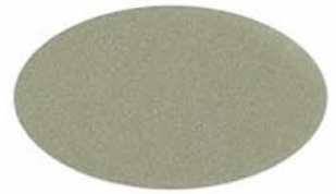
CASHMERE PEARL UC106689F/5VMN86965P