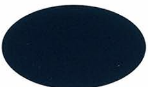
MIDNIGHT BLUE ICE UC106723LB*/3ZML87002P

UC Code = Extrusion Code Number 3ZM/4ZM Code = Coil Code Number