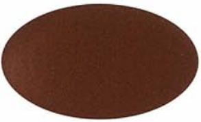
RUSSET PEARL UC106696F/5VMR86972P