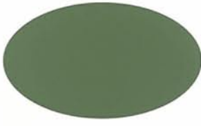
GLADE GREEN UC105745/5MG86770 PD400002