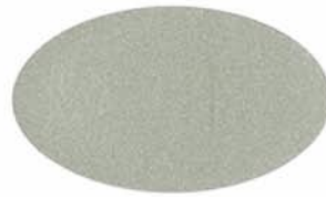
MOONDUST MICA UC106688F/5VMA86964P