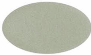
NATURAL SUEDE MICA UC106666F/5VMA86963P