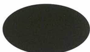
CHOCOLATE BRONZE UC106709XL/3ZMN86986P