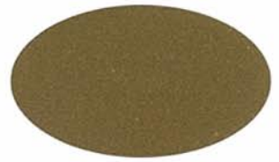
ROMAN BRONZE MICA UC106691F/5VMN86967P