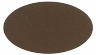
HAZELNUT MICA UC106699F/5VMR86975P