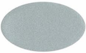
SILVERSMITH Classic UC70092F/5VMA86003P