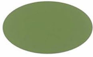
ECO-GREEN UC105755/5MG86919 PD400001