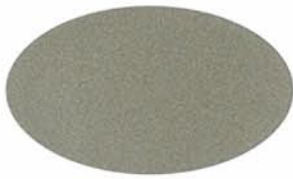
CHAMPAGNE BRONZE Classic UC70202F/5VMN82395P