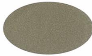
HARVEST GOLD PEARL UC106690F/5VMN86966P