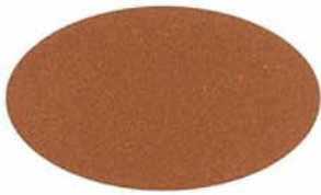
LIQUID COPPER MICA UC106697F/5VMR86973P