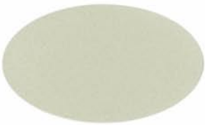
MANHATTAN BEIGE PEARL UC106687F/5VMN86962P