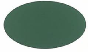
URBAN MIST GREEN UC106679/5MG86920 PD400003