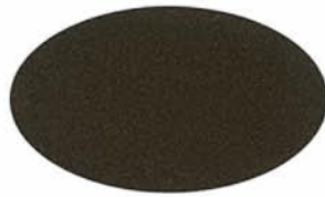
LEXUS BRONZE UC106698F/5VMN86974P