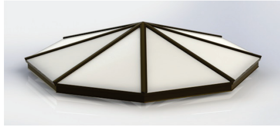
Flat Glass Octagon